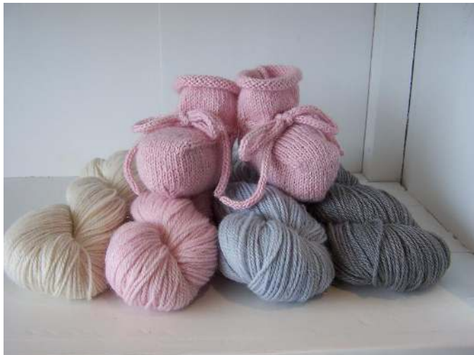
(L to R: White, Light Pink, Light Blue, Grey)