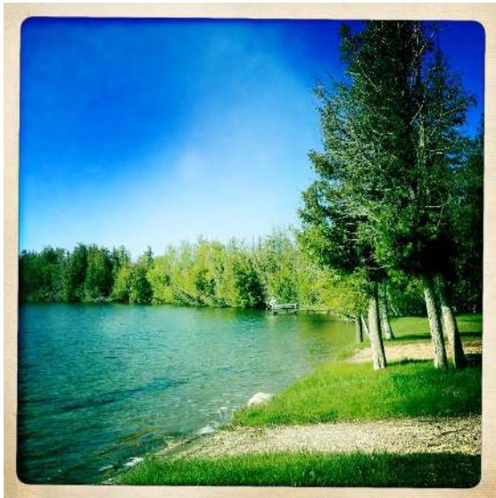
(Lake Leelanau at Hohnke Beach, May 13th)