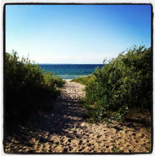
(The entrance to my favorite beach, Good Harbor. May 29th, 2012. And yes, the water is cold!)