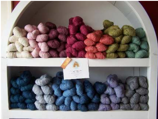
(Top Row, L to R: Orchid, Plumeria, Plum, Dragonfruit, Guava, Chiclet Tree, Fern.