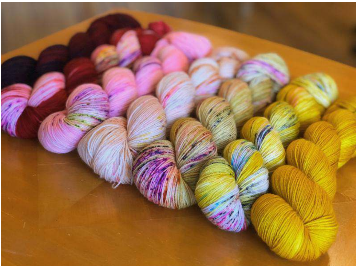
From L to R: Poison, Sari, Rosehip, Monarch, Harvest, Fool's Gold, Pollen