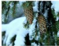
Whaleback Pine Grove