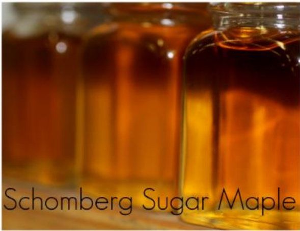
Schomberg Sugar Maple