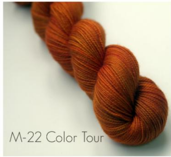
M-22 Color Tour