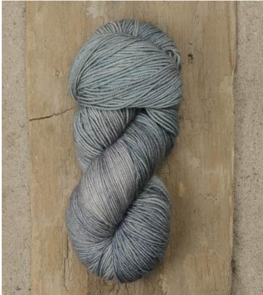
Petoskey Stone: our state stone and one of the most gorgeous gray yarns we've ever seen. Now in a NEW superwash Merino/nylon base!

You can also order the stitch markers, available in sets of five.