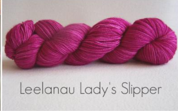
Leelanau Lady's Slipper