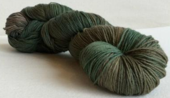
Whaleback Pine Grove