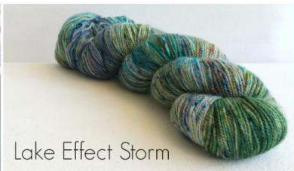
Lake Effect Storm

"There is peace, even in the storm." -Vincent van Gogh