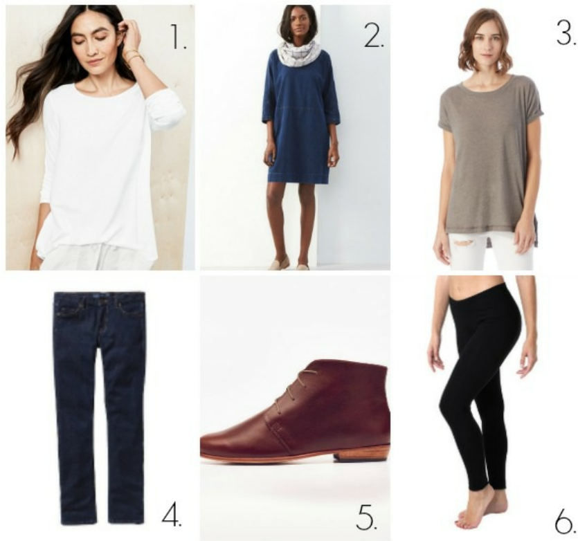
1. Eileen Fisher lightweight jersey top via Garnet Hill