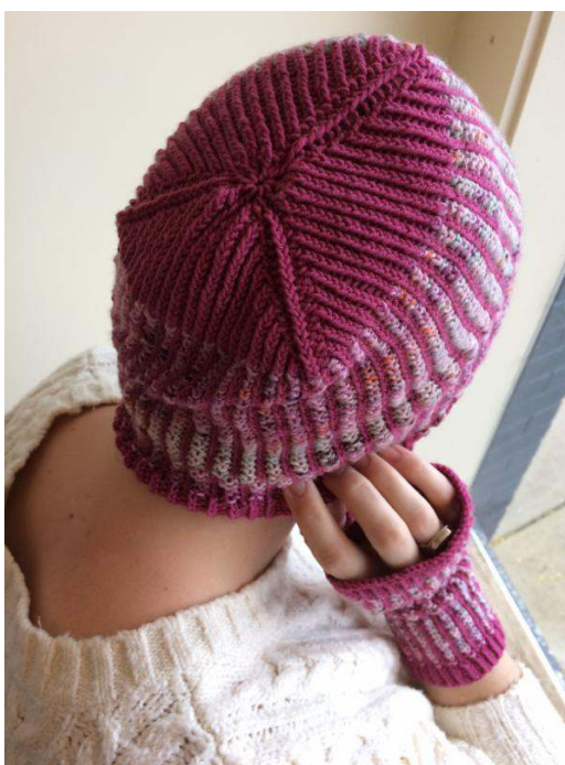
Knit Seven: Candy Striped Hat and Mitts