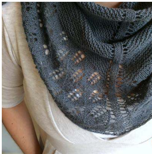
Knit Two: Lakeside Lace Kerchief