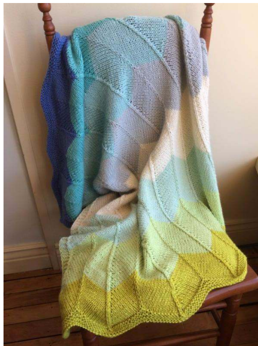
Knit Four: Ziggy Baby Blanket