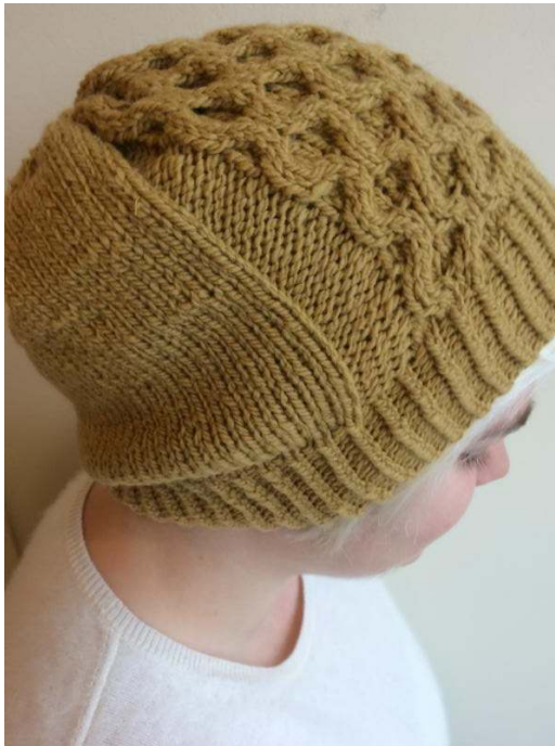
Knit Six: Honeycomb Toque