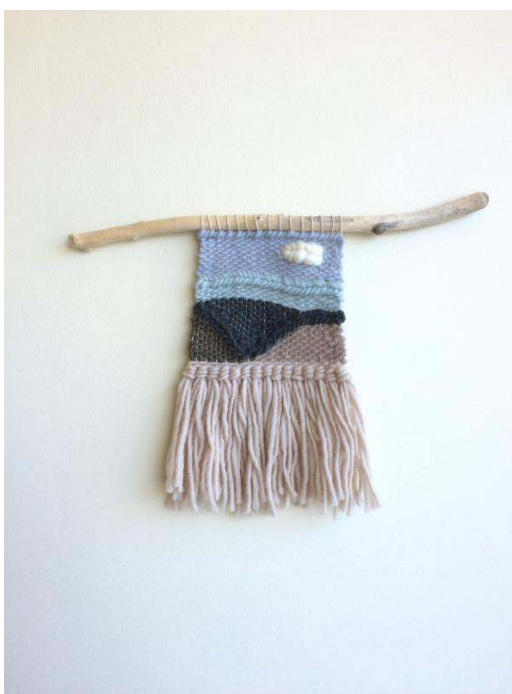
Knit One: Shoreline Tapestry Kit