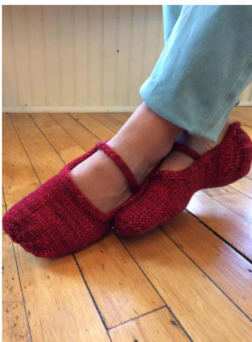
Knit Three: Clara's Slippers