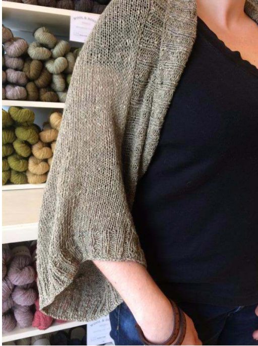
Knit Five: Evergreen Shrug