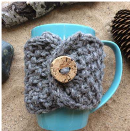
Knit Eight: Little Cabin Mug Cozy