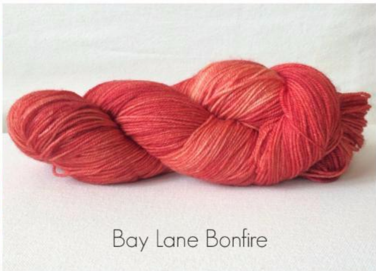
Bay Lane Bonfire