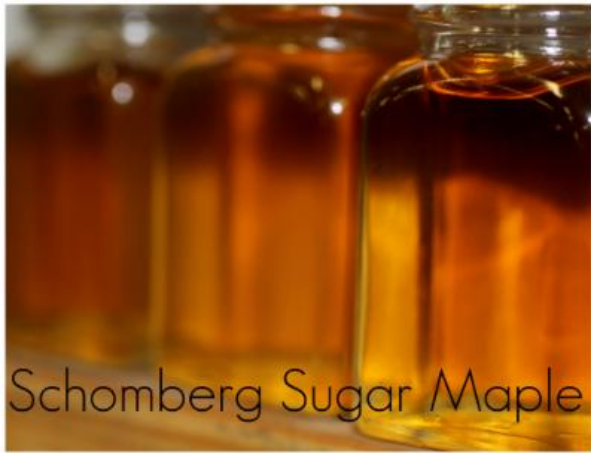
Schomberg Sugar Maple