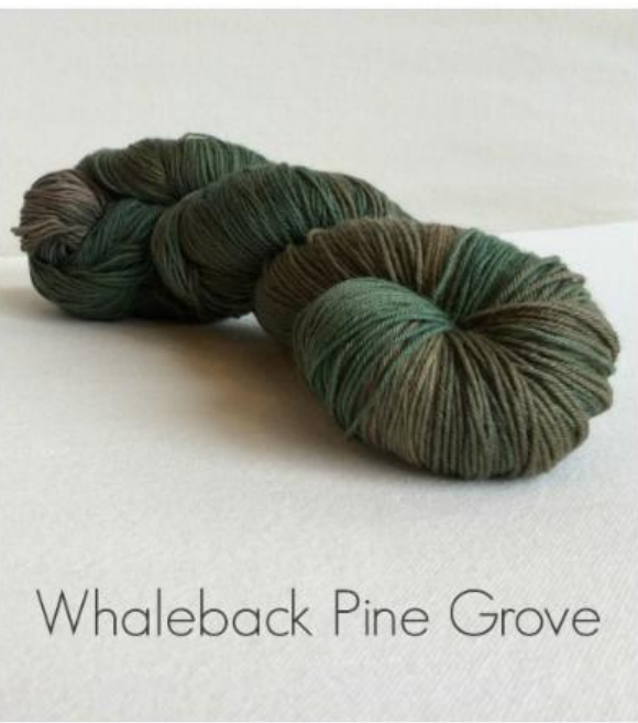
Whaleback Pine Grove