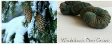
Whaleback Pine Grove