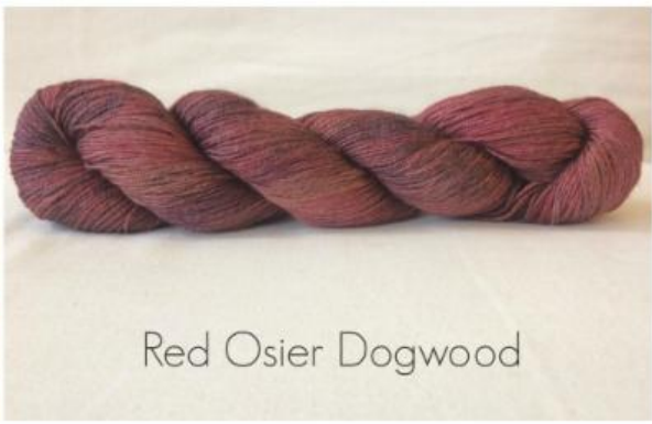
Red Osier Dogwood