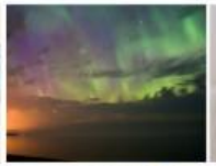
Lake Michigan Northern Lights