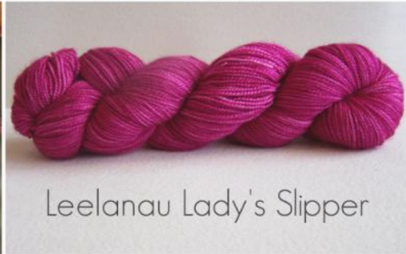
Leelanau Lady's Slipper