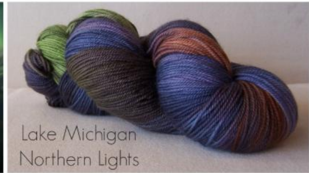
Lake Michigan Northern Lights