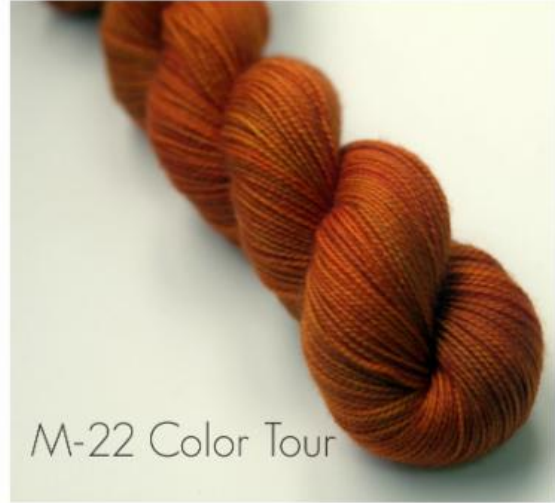
M-22 Color Tour