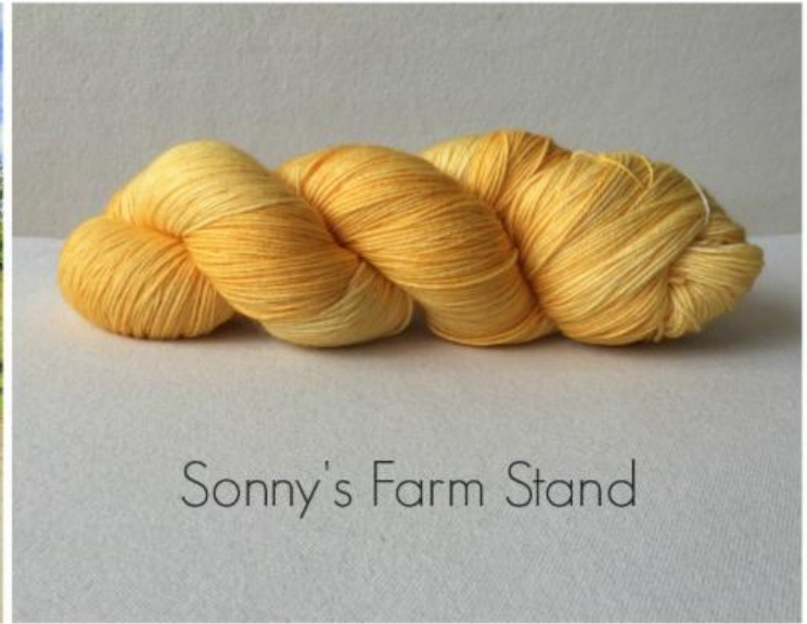
Sonny's Farm Stand