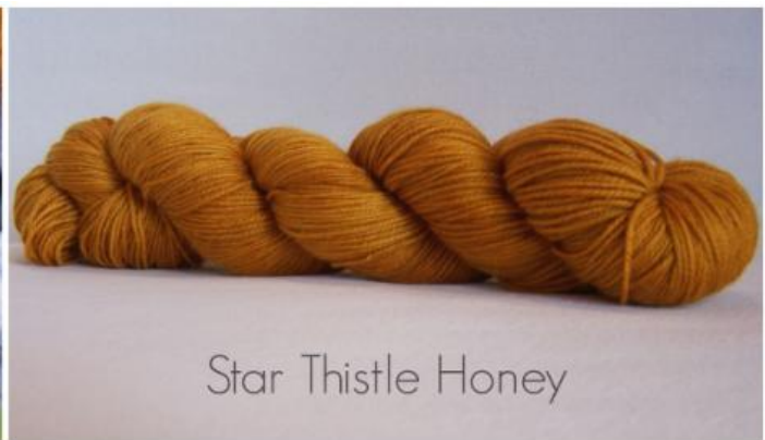
Star Thistle Honey