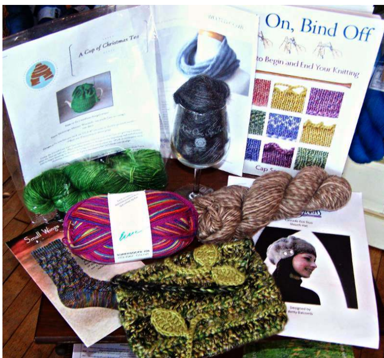
(one of the three Grand Prize baskets)

Each store will be offering special discounts, which are as follows: