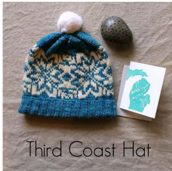
Third Coast Hat