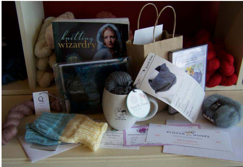
(one of the three Grand Prize baskets)

Take an entire weekend to enjoy the experience of shopping eight different yarn shops around the Grand Traverse Area, where each shop will highlight unique yarns and patterns, offer refreshments and ideas for handmade holiday gifts. Purchase a $5.00 passport and get an exclusive logo tote bag, available Wednesday, September 24th while supplies last. Stamp your passport at all eight shops and you'll be eligible to win one of three Grand Prize Baskets, which each include a $20 gift certificate to all eight shops and several other exclusive prizes.