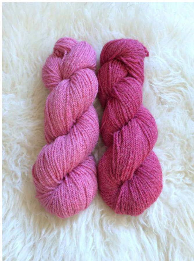
Fresh Water Fibers yarn dyed with Cochineal

(We recommend Michigan-made Fresh Water Fibers , a 50/50 worsted weight blend of Michigan-grown and spun Merino and alpaca.)