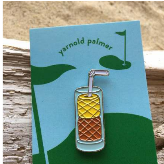
Yarnold Palmer! So clever!