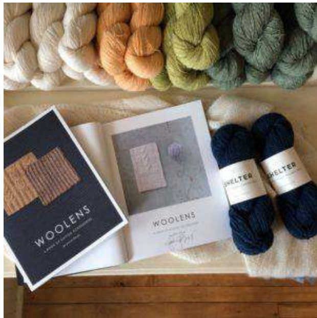
Wool & Honey's contribution to the prize baskets—a signed copy of Jared Flood's book, Woolens , and two skeins of Brooklyn Tweed Shelter in Almanac.

What we're saying is this: you shouldn't miss next weekend. Truly. It's going to be a weekend filled with shiny, happy knitters in their natural habitat. We're going to have hot coffee and pumpkin doughnuts and good music and friendly smiles, and gosh darn it, we're going to have yarn.