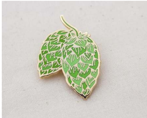
Hops for Michigan brewers

We couldn't help it--we've fallen for the enamel pin craze! We've put together a unique little collection of these cute and witty pins--we hope you love them as much as we do.