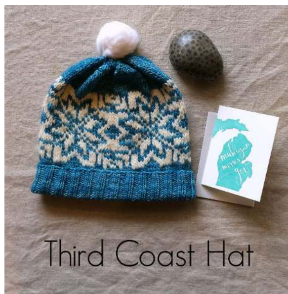
Third Coast Hat