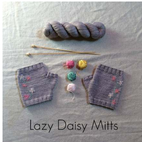
Lazy Daisy Mitts