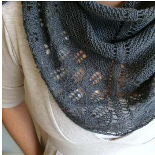
Knit Two: Lakeside Lace Kerchief