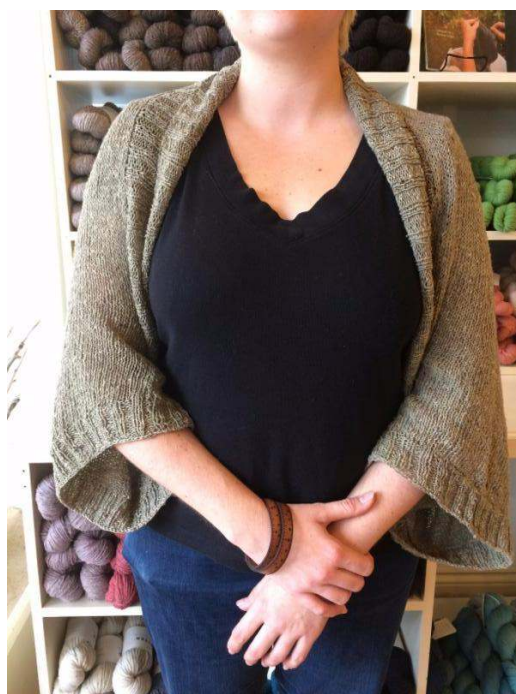
Knit Five: Evergreen Shrug