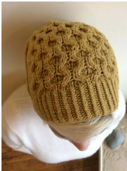
Knit Six: Honeycomb Toque

Read more about the 12 Knits of Christmas 2017 HERE.