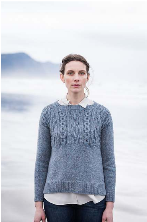
Caspian by Jared Flood