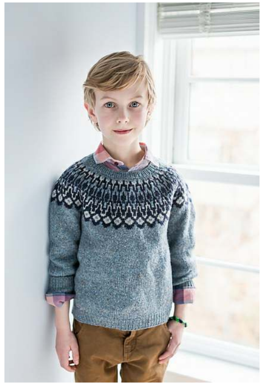
Atlas by Jared Flood