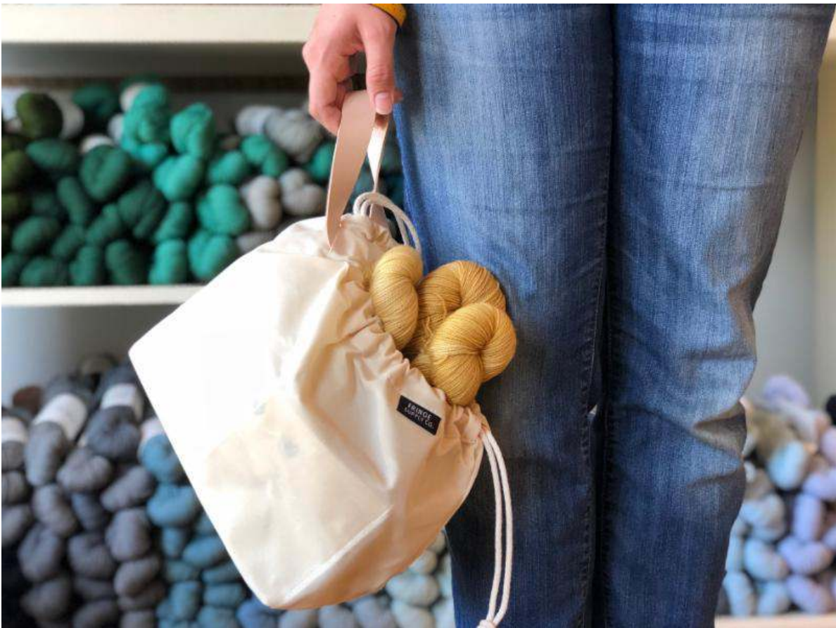
Field Bag in Waxed Natural

Portable, stuff-able and capable of carrying 2-3 small projects, Field Bags are the consummate project bag for traveling knitters. There are impeccably-designed interior pockets for notions, double-pointed needles, pens, a