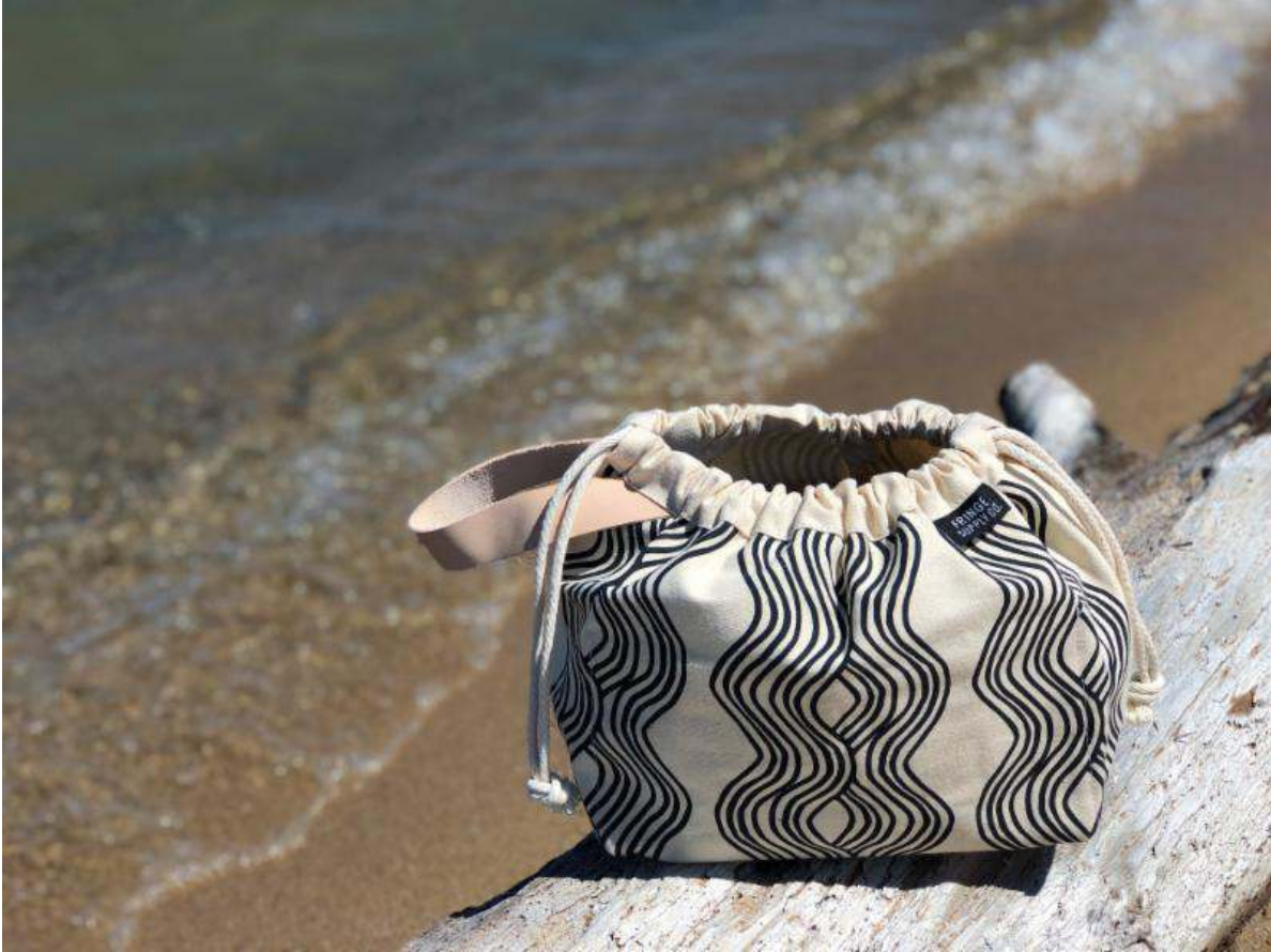
limited edition Field Bag in 'Hank'