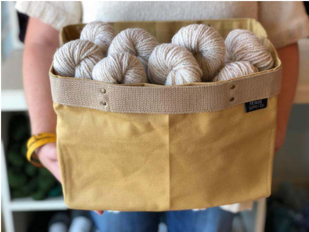
the Porter Bin in Butterscotch

folded 8 1/2" x 11" pattern, and grommets for threading and separating yarn balls for colorwork. They can be easily tossed into a larger purse or a tote bag, and two Field Bags can be tucked neatly inside their big sister, the Porter Bin .