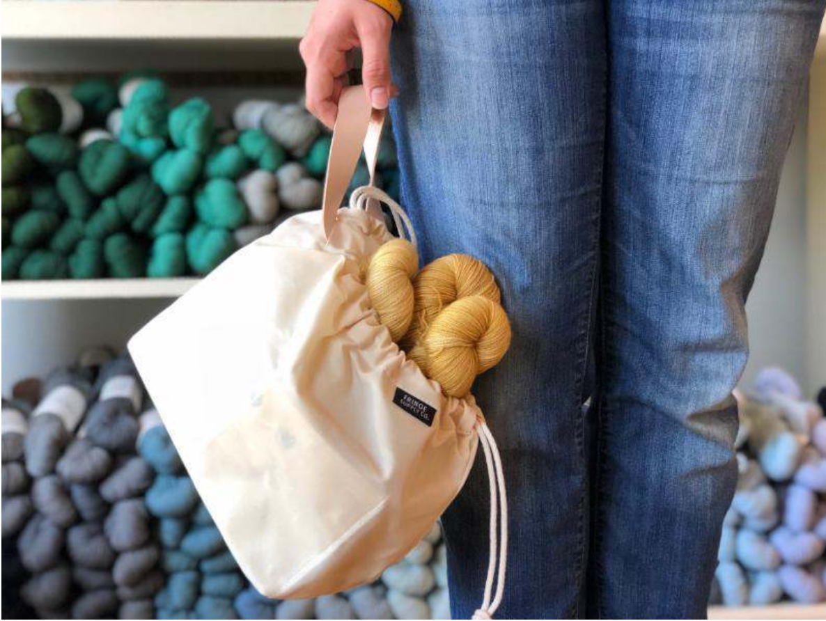
Field Bag in Waxed Natural

Portable, stuff-able and capable of carrying 2-3 small projects, Field Bags are the consummate project bag for traveling knitters. There are impeccably-designed interior pockets for notions, double-pointed needles, pens, a folded 8 1/2" x 11" pattern, and grommets for threading and separating yarn balls for colorwork. They can be easily tossed into a larger purse or a tote bag, and two Field Bags can be tucked neatly inside their big sister, the Porter Bin .