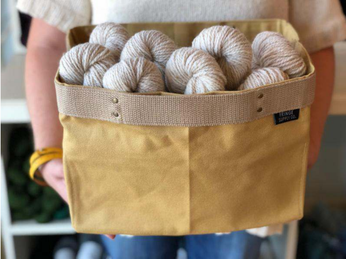
the Porter Bin in Butterscotch

And of course we'd be remiss if we didn't mention the fact that Field Bags provide the ideal backdrop for the ubiquitous enamel pin . We don't mind saying that we've got a stellar collection here at the shop; whether you want to say something quirky, sweet or pledge allegiance to the humble S'more, we've got the pin for you.