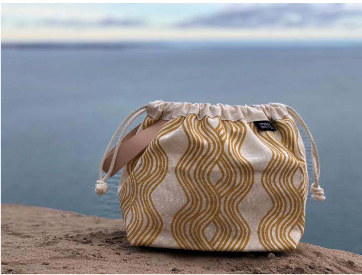
The Honey Hank atop Pyramid Point