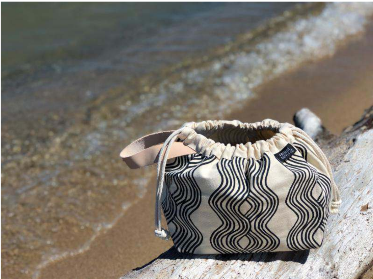
limited edition Field Bag in 'Hank'