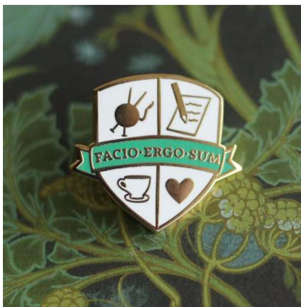
Facio Ergo Sum -- 'I Make, Therefore I Am'

Looking for a little embellishment for your Fringe Field Bag ? Jazz things up with a little pin or button!