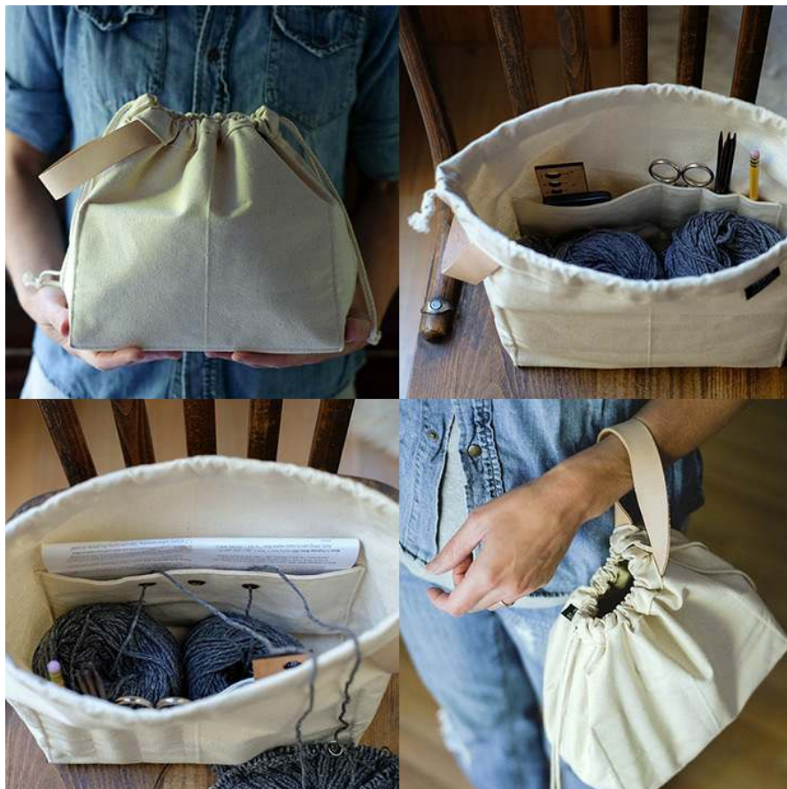
the original Field Bag in Natural

These bags are handmade in Nashville, TN from sturdy waxed cotton canvas with a vegetable-tanned leather carry loop, which will age to a beautiful golden brown. This bag is designed to stand up, with a wide-open mouth. There is ample room for your yarn and knitting. And there are pockets! On one interior wall is a panel divided into one medium-sized pocket (perfect for your phone and/or small notebook) and three narrow pockets for needles, tools or writing implements. On the opposite interior wall is one long pocket, sized to hold a folded pattern.