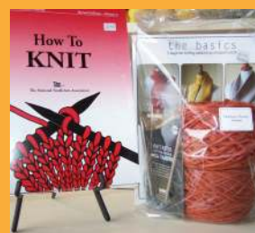
Learn to Knit Kit $20.95