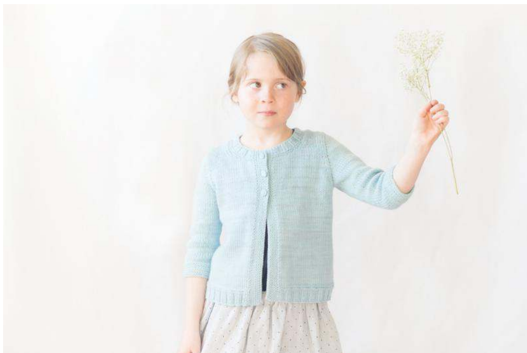
Canvas Cardigan (Kids)

A simple yet timeless cardigan to fit both women and children (sizes 2-12). We've created kits for the Canvas Cardigan in the newest yarn in the shop, Quince & Co. Phoebe. Spun from the finest commercially-available American extra-fine merino wool, Phoebe is unbelievably soft and luxurious to knit with, creating the most satisfying fabric--silky, bouncy, decadent stuff. The kits are available in either color, Uranus (light blue) or Neptune (dark blue,) as featured in Dots .