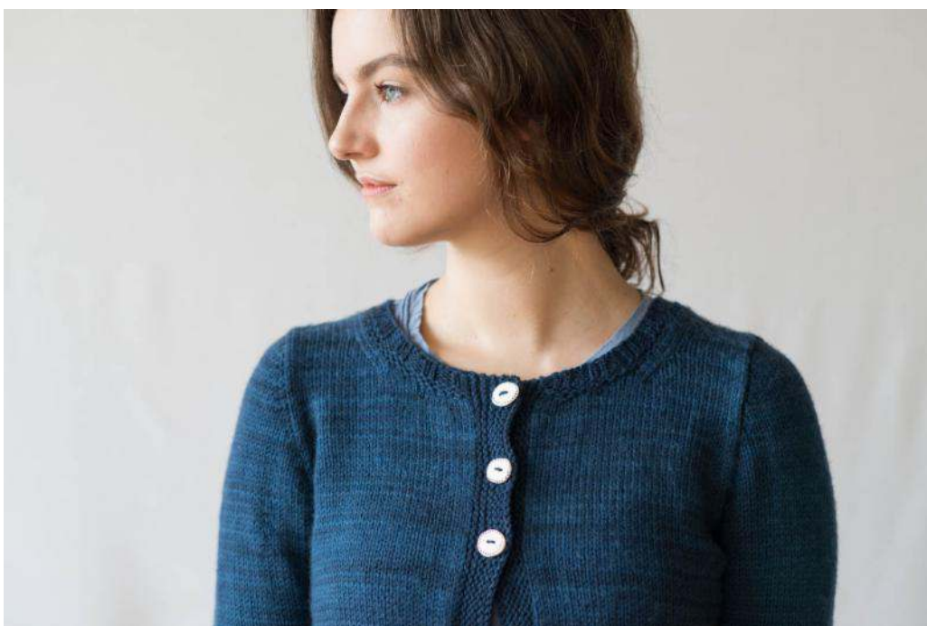
Canvas Cardigan (Adults)