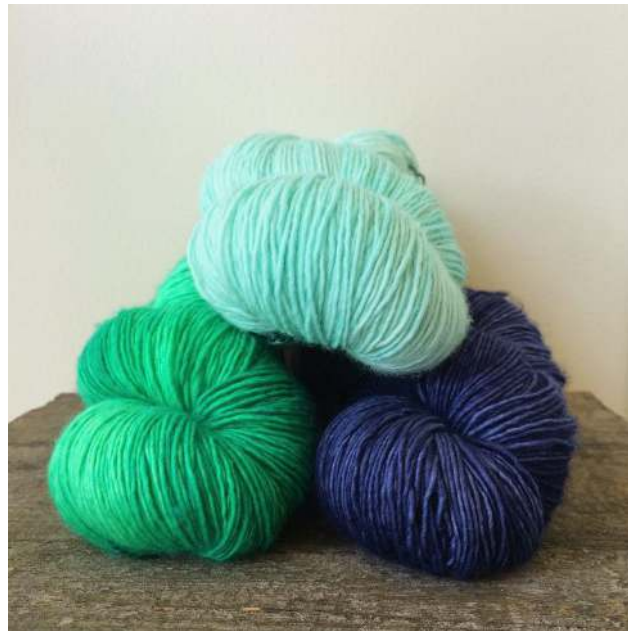
new colors of Tosh Merino Light in Not Sorry, Havana + Ceremony

We plan to kick off our summer season in the way we always do--with our annual anniversary party.