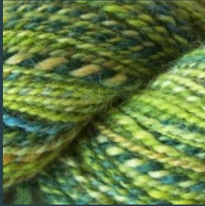
Michigan Wool Handspun