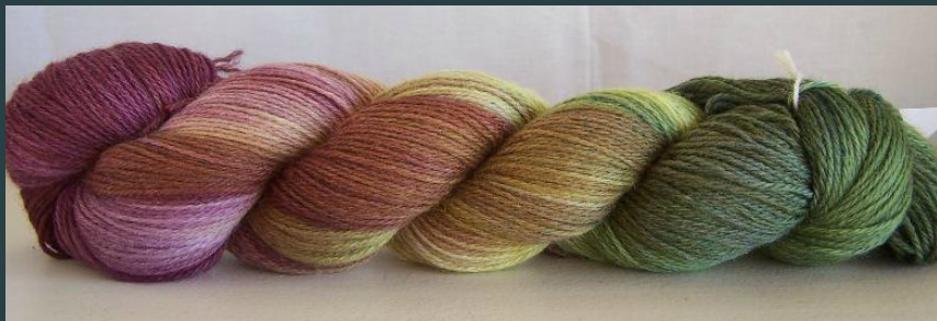
Superwash Fingering Weight