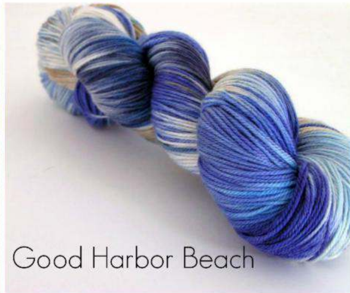
Good Harbor Beach

"Summer afternoon--summer afternoon; to me those have always been the two most beautiful words in the English language."