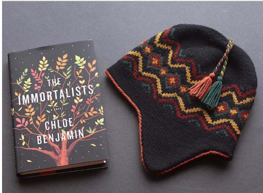
Big Nomad, Little Nomad Hat Kit with Quince & Co. Chickadee

Can't be with us? All of our Immortalists-inspired kits are available to ship right away; if you get started now, you'll have handknits ready to wear as soon as the weather begins to turn again.