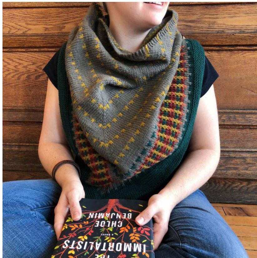
Outing Shawl Kit with Quince & Co. Lark