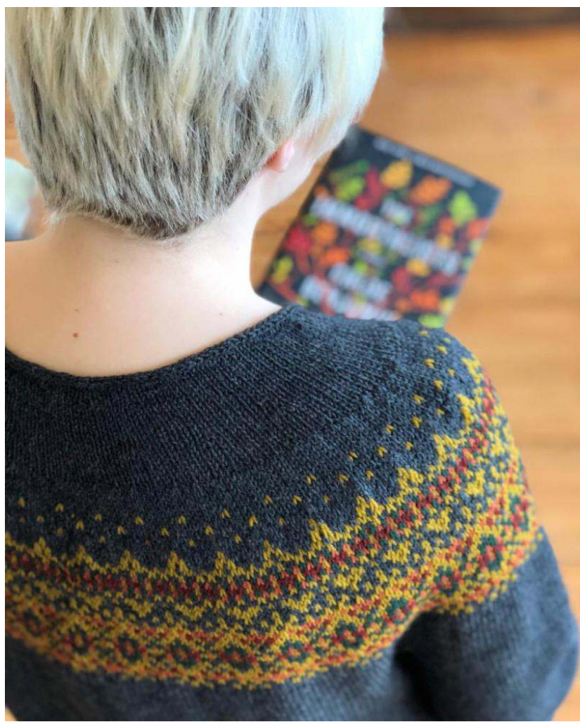
Aamu Sweater Kit with Quince & Co. Finch