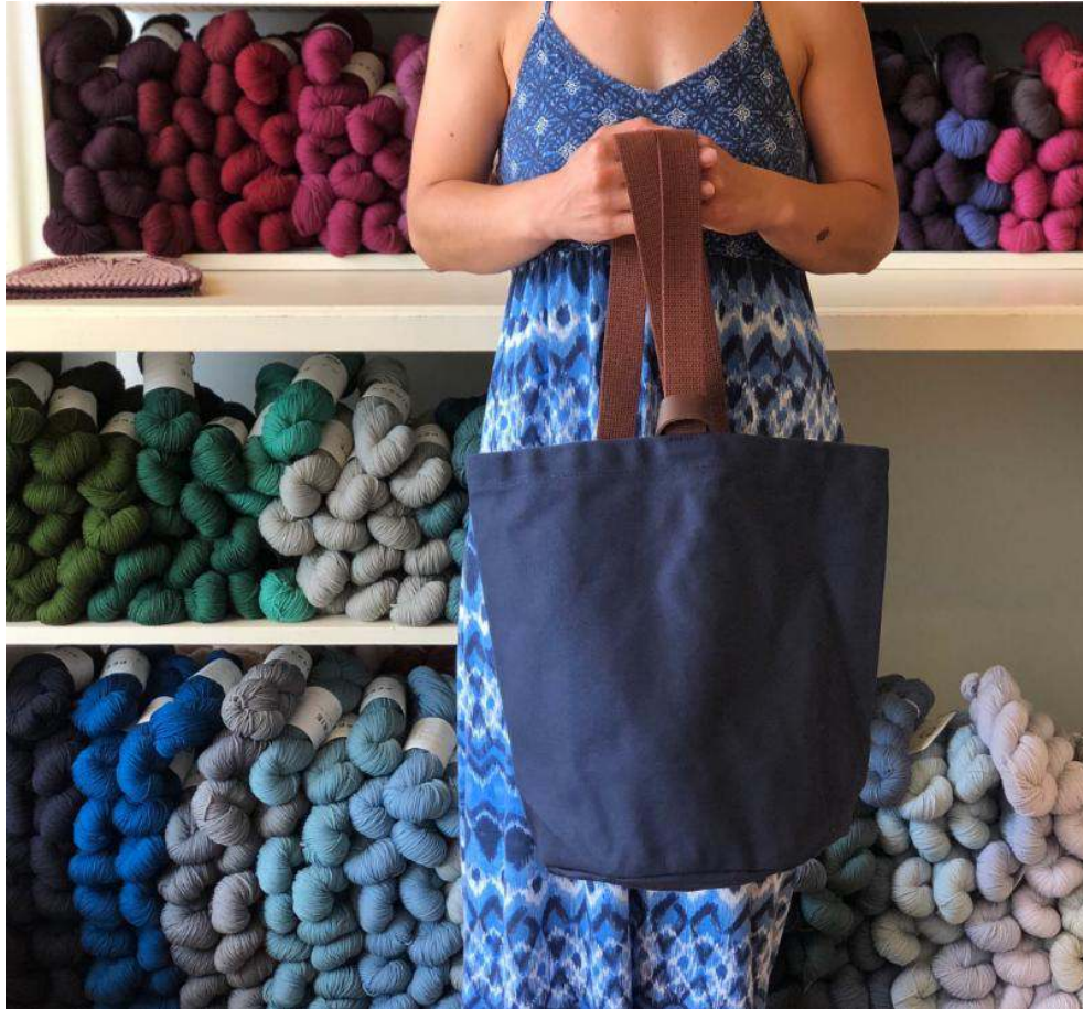
The Knitter's Backpack in Midnight

We are thrilled to be the newest LYS carrying the popular Knitter's Backpack by Ritual Dyes! Constructed from 18 oz. water-repellent canvas, thick cotton webbing straps and a leather hang loop. This innovative and versatile bag can be set on the ground and knit from like a yarn bowl, carried on your forearm, pull the straps through and wear it like a sling bag or split the straps and carry it like a true backpack, knitting all the while. It has a modern and sophisticated shape you won't tire of. Take this bag anywhere!