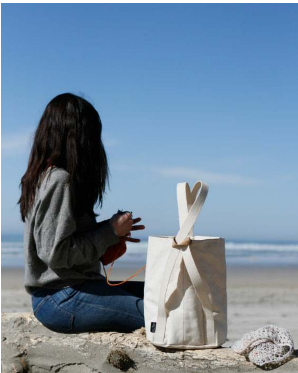
The Knitter's Backpack , shown here in Natural

No matter where you're heading this summer, no matter which projects you need at your fingertips, we've got a collection of beautiful bags to carry them in.