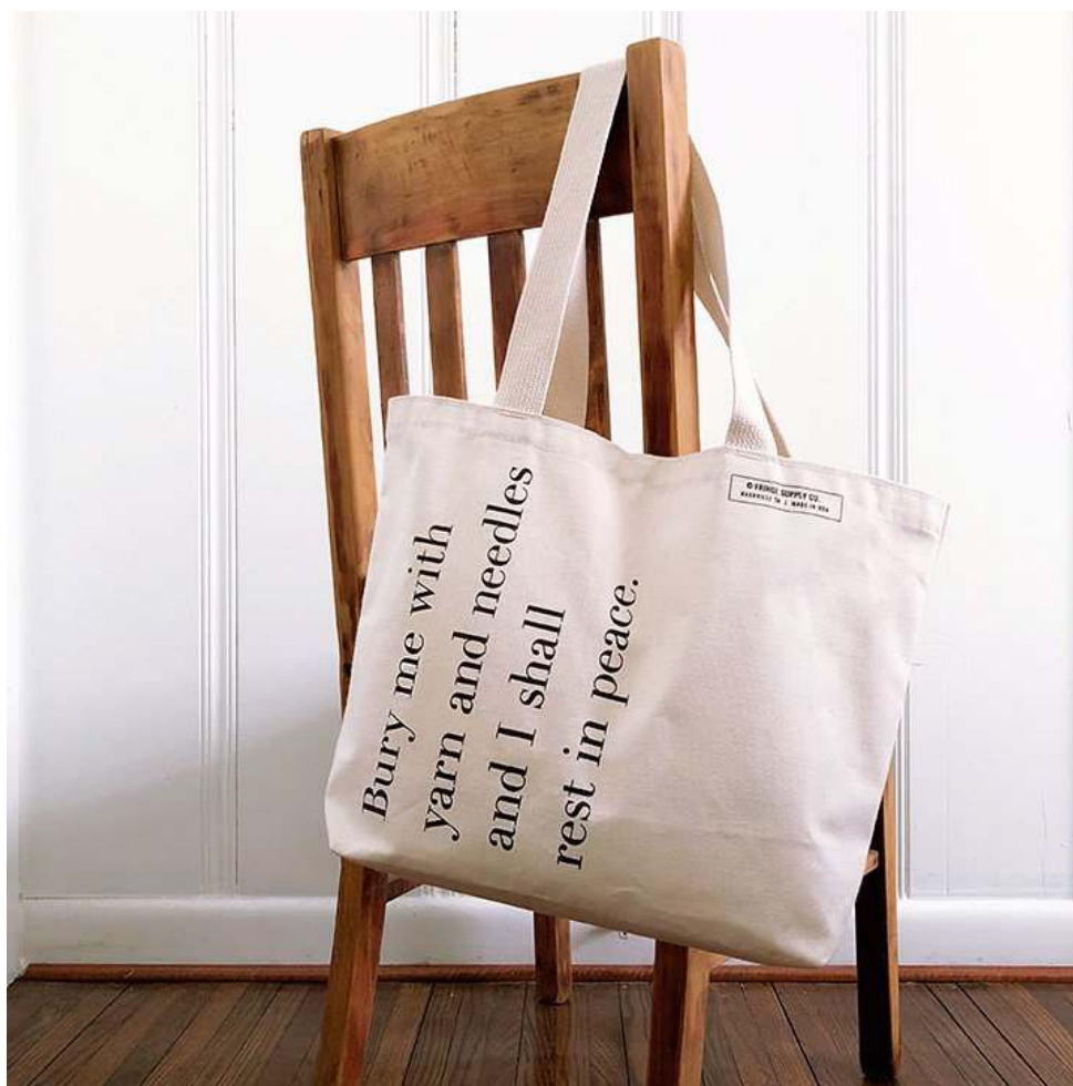
The 'Bury Me' Tote Bag, new from Fringe Supply Co.

A sturdy, generously sized, canvas tote bag is a thing of great beauty and use. This witty bag isn't really morbid like it first appears; really, don't we all just want to be heaped with yarn and left to our own devices? Hilarious. (And TRUE. ) The ' Bury Me' tote bag is the newest in the Fringe Supply Co. collection of project bags.