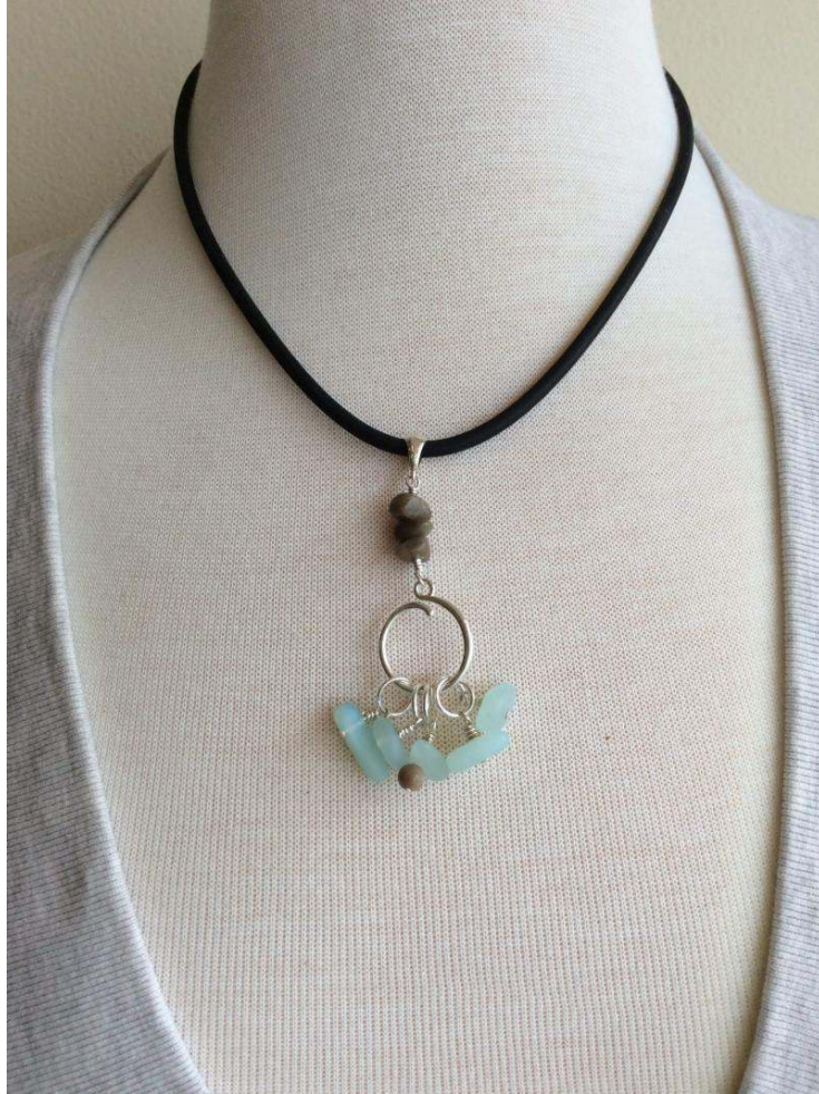
Petoskey stone stitch marker necklace + beach glass markers