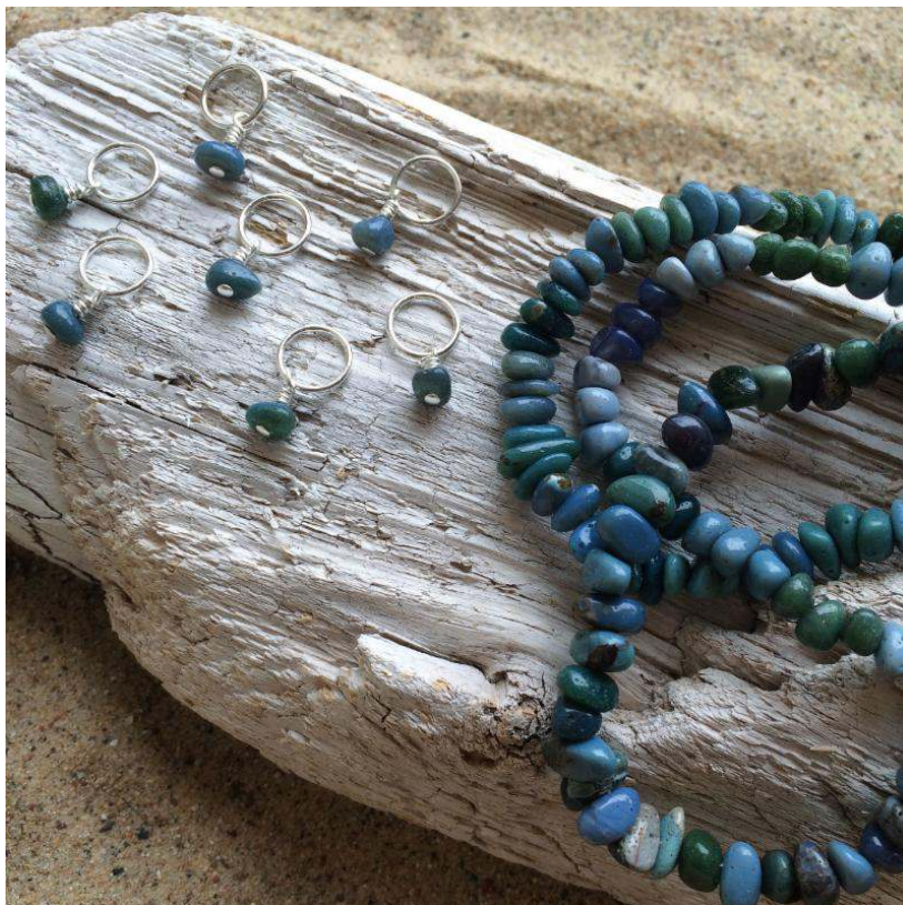
Leland blue stitch markers