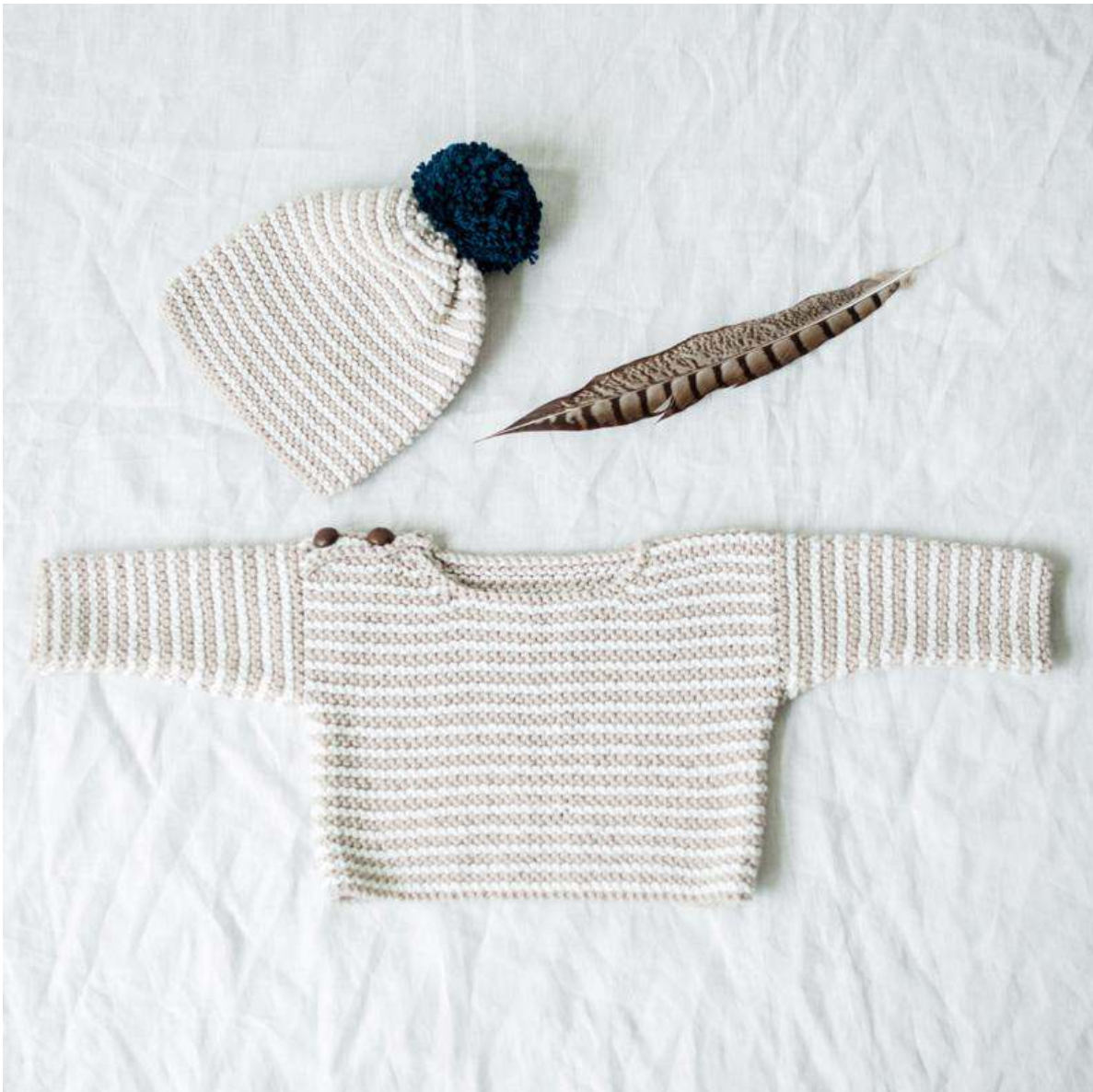
Whitman Hat & Sweater Kit

Not sure what to knit with Whimbrel ? Try one of our kits!