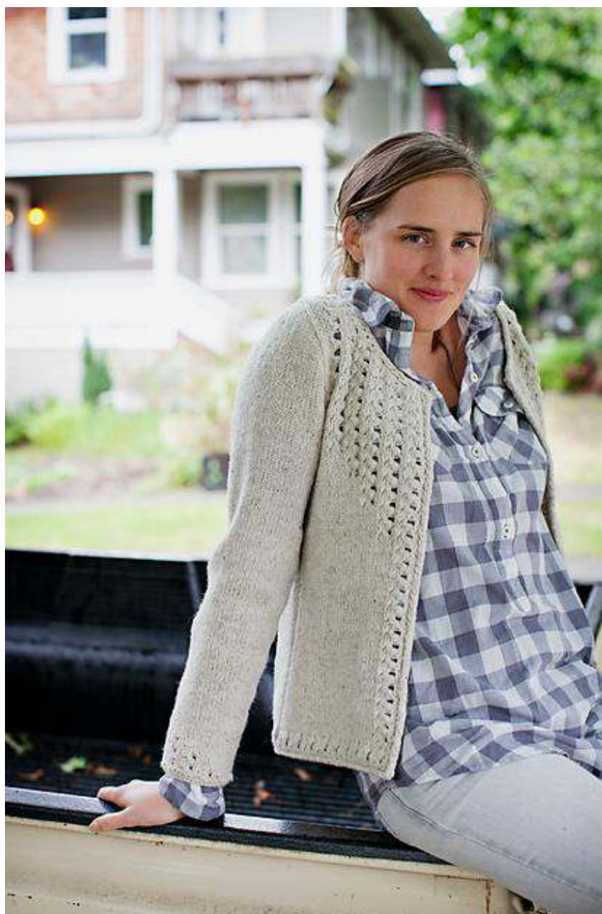
Sullivan Sweater Kit

Find the Whitman Hat & Sweater Kit HERE .