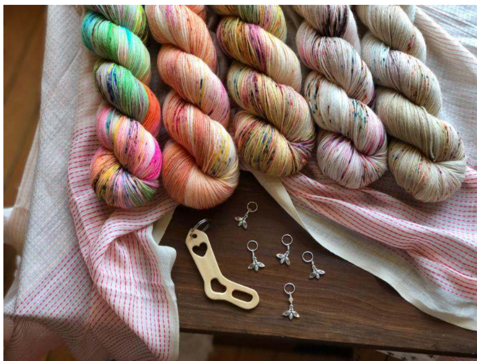
Hedgehog Fibres Sock Yarn L to R in Beach Bunny, Monarch, Dijon, Bramble + Cereal

Socks: the ultimate in travel knitting. When you want something that's not too hot on your lap, something that's easy enough to knit with friends and a bottle of wine, when you want a few more speckles in your life, might we suggest knitting a pair of socks? They're portable and fun and a little like fancy lingerie: perhaps no one can see your handknit socks inside your shoes, but you know they're there! Pick a simple pattern--our Simple Socks is a great starting point!--and several colors