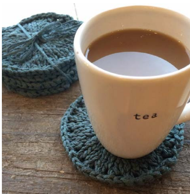
Knit Six: Morning Star Hat