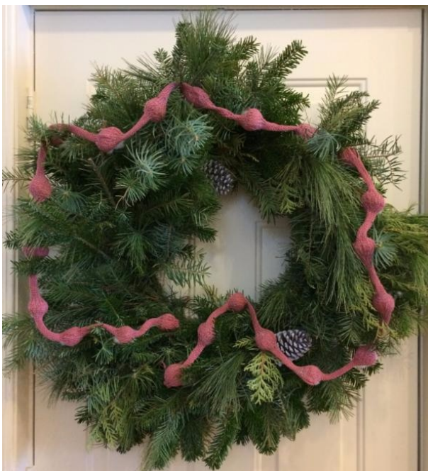
Knit Twelve: Sunshine Sweater