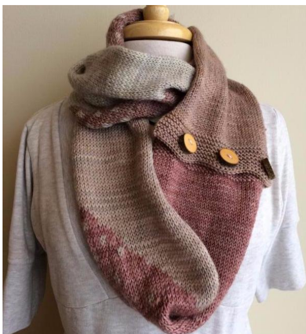
Knit Eleven: Flaxen Garland