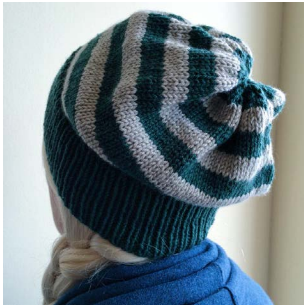
Knit Five: Sencha Coaster Set