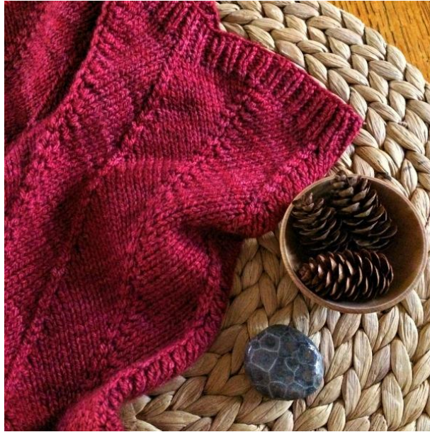
Knit Four: Staple Stripes Hat