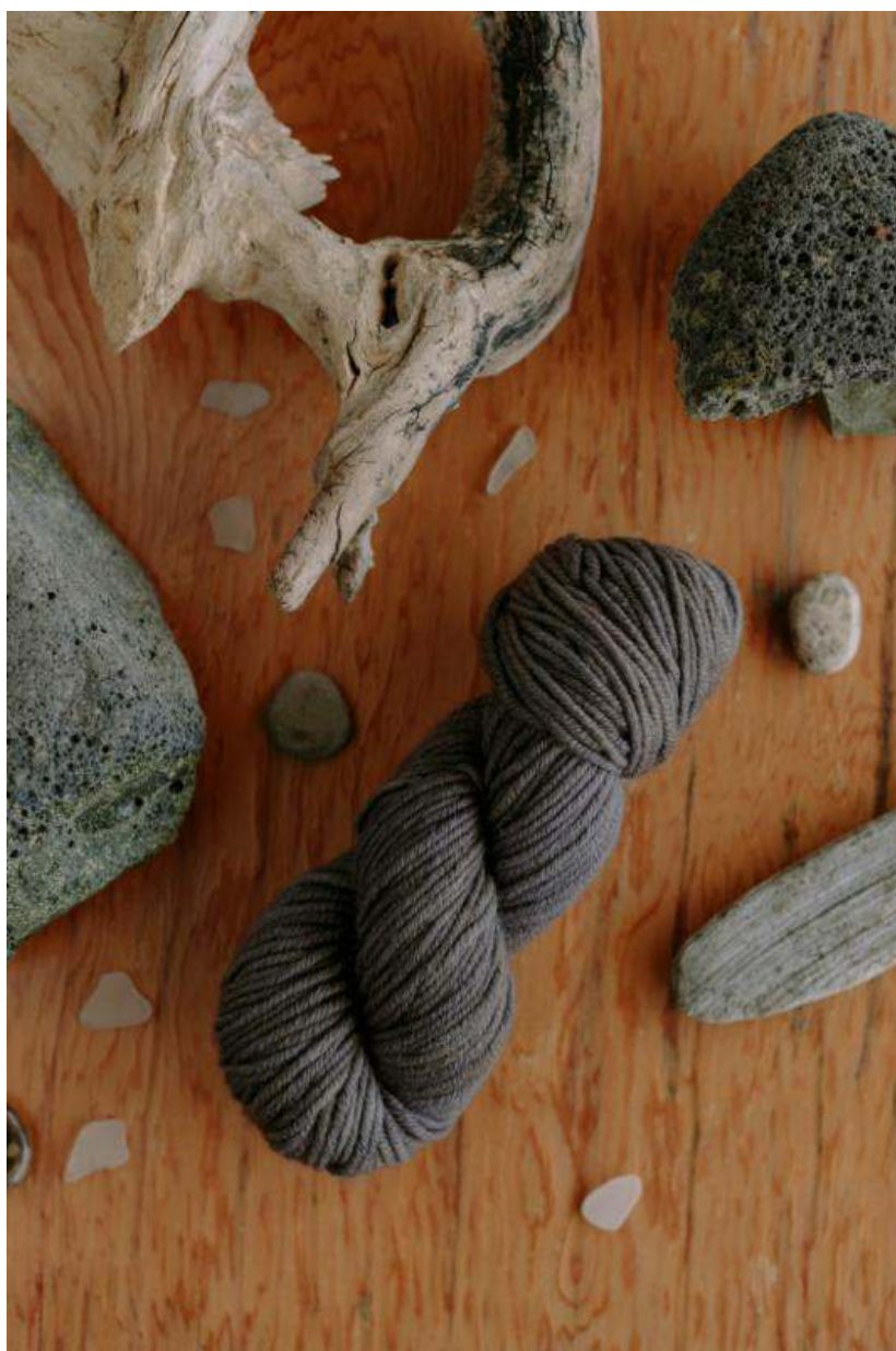
Good Harbor Bay