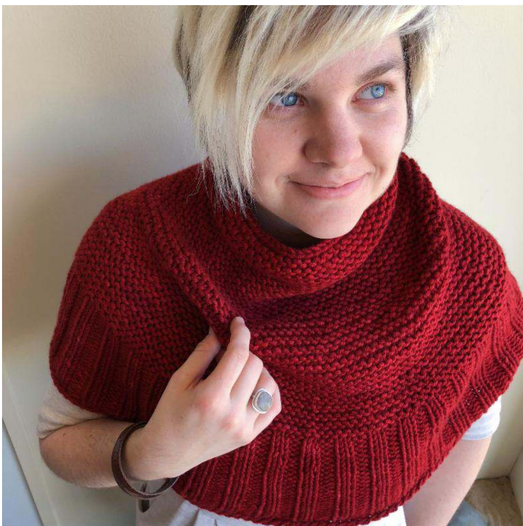
Getting Warmer, a NEW kit, knit with 3 skeins of Plucky Knitter Snug in M- 22