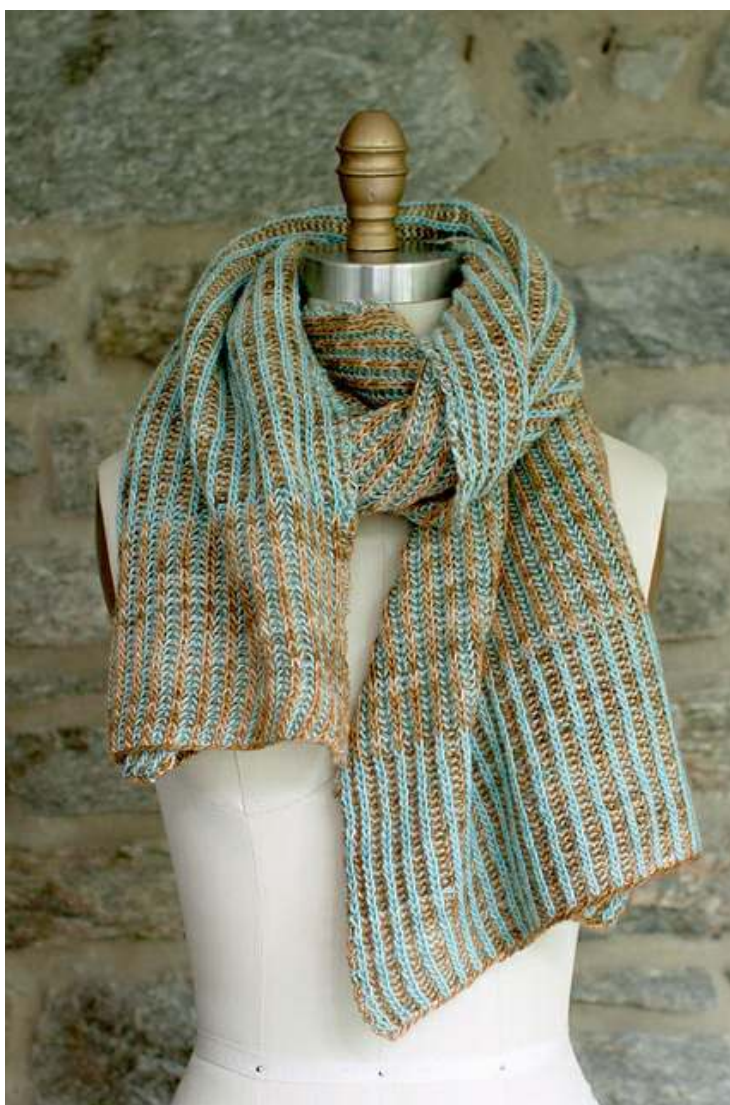
Churros Scarf Kit