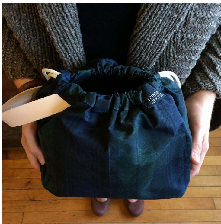
The Fringe Field bag in Waxed Black Watch Plaid