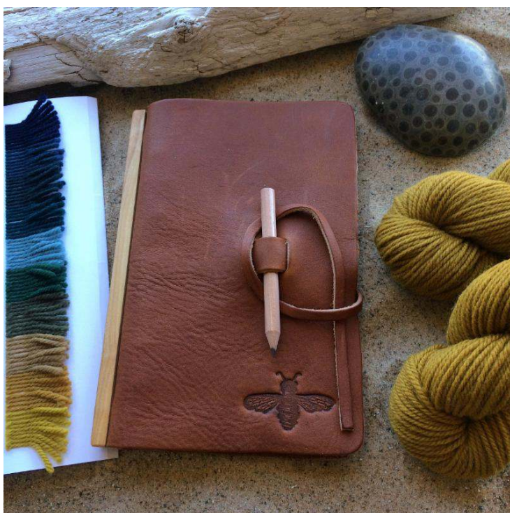
Our leather bee journal , made in Empire