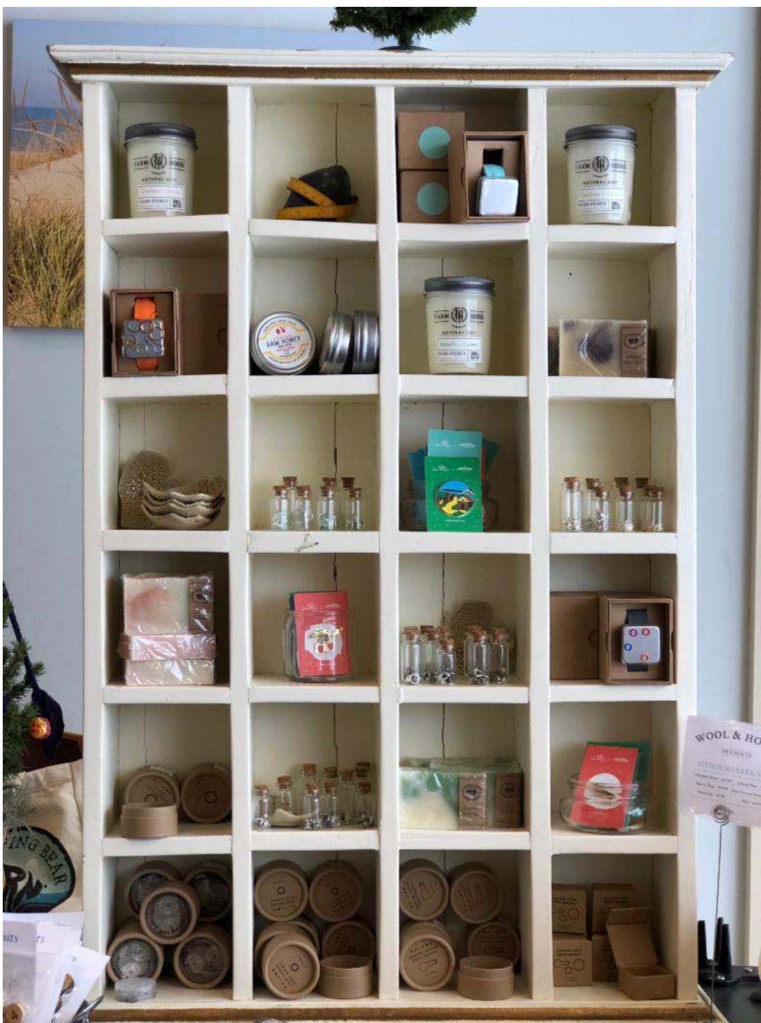
SO many amazing stocking stuffers!