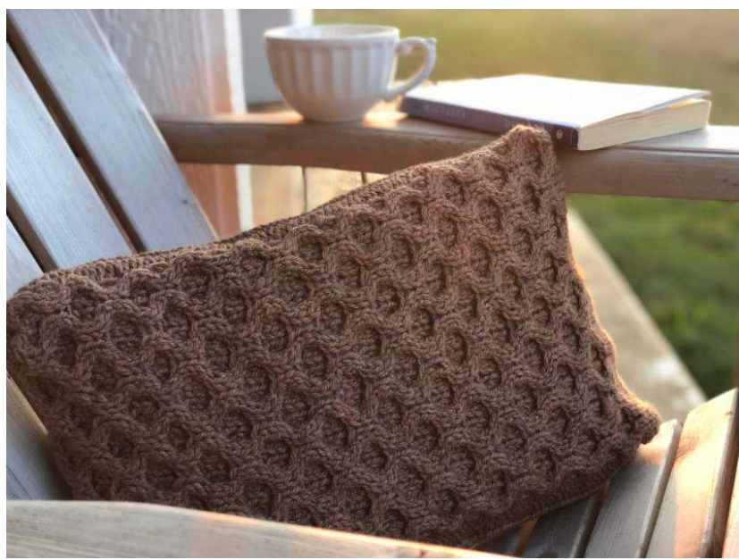
Knit Three: Bee Dreams Pillow