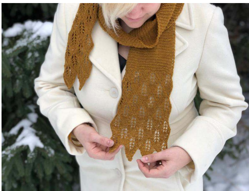
Knit Eleven: Gilded Leaf Scarf