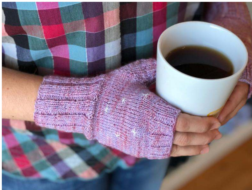
Knit Two: Sugarplum Fairy Mitts