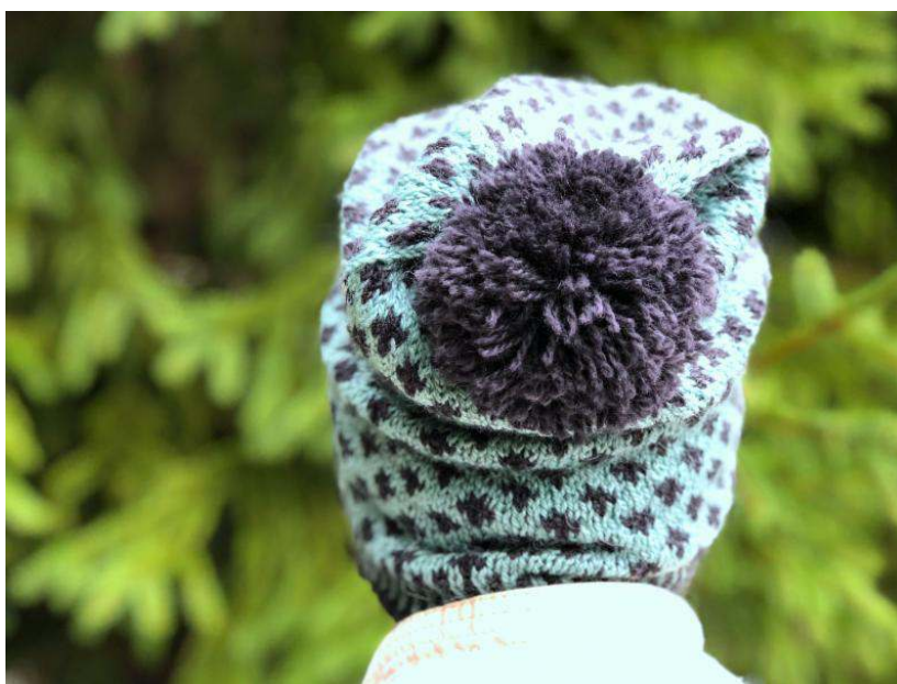
Knit Five: Alpine Slouch Hat