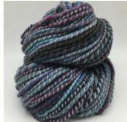
Good Morning Headache