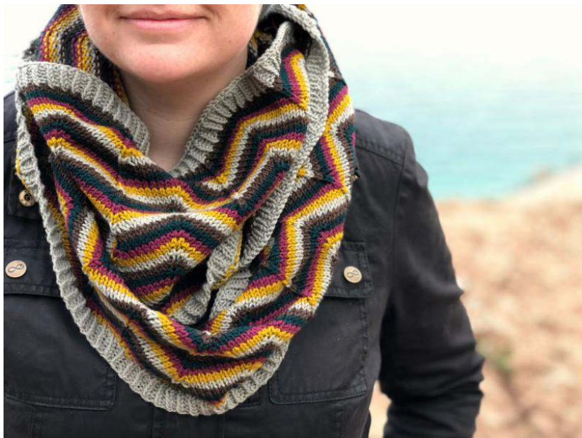
Knit Eight: Trail's End Cowl