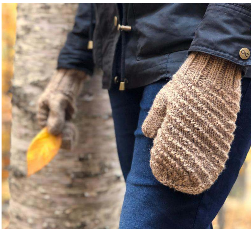
Knit Nine: Cinnamon Twist Mittens