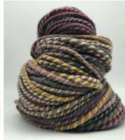
Baby's on Fire