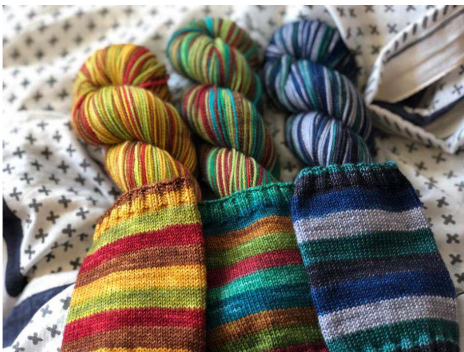
self-striping sock yarn from Rock and String Creations