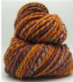
Pass The Dutch