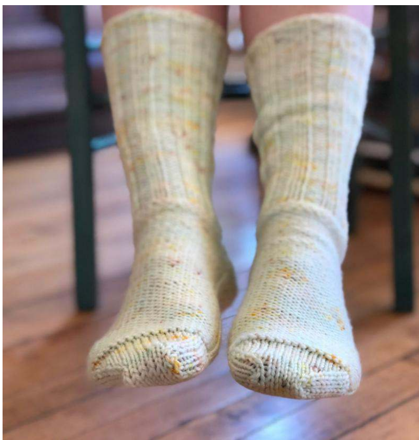
Knit One: Wintergreen Slipper Socks