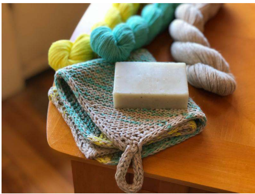
Knit Seven: Marled Linen Facecloth