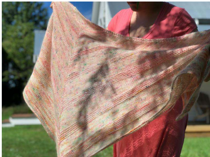
Knit Four: Pink Peppermint Bark Shawl