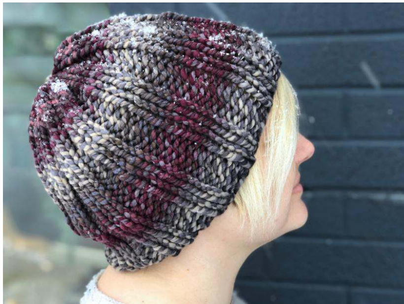
Knit Twelve: Hygge Hat