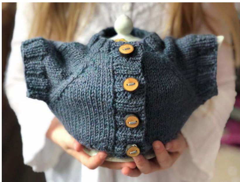
Knit Ten: Mrs. Potts' Tea Cozy