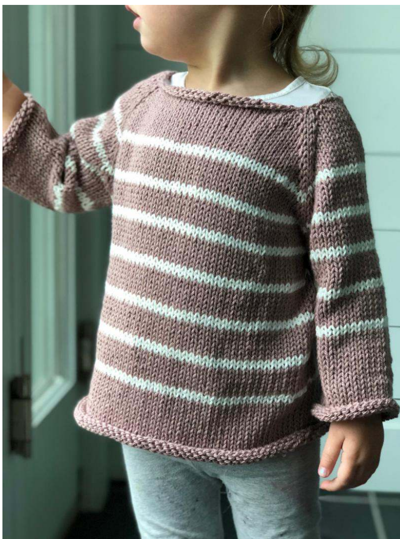
Knit Six: Petit Bardot