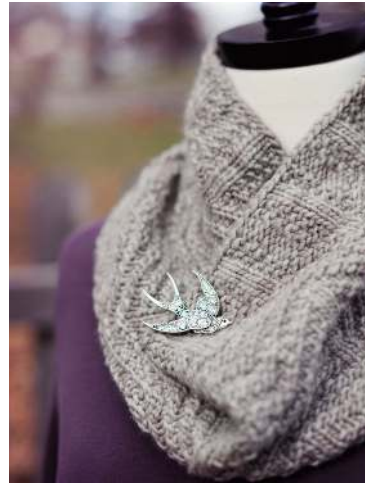
Fernfrost Shawl (left, in laceweight) and Dovetail Cowl (right, in worsted weight)