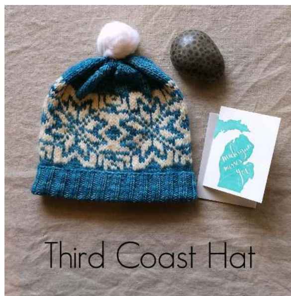
Third Coast Hat