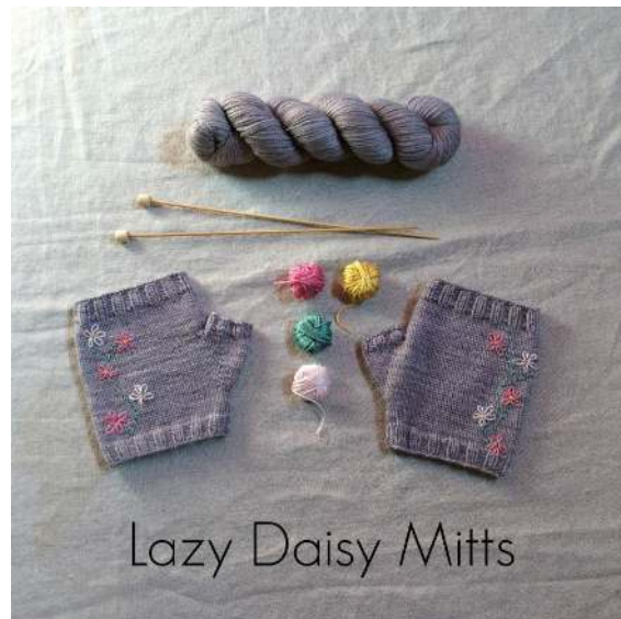
Lazy Daisy Mitts