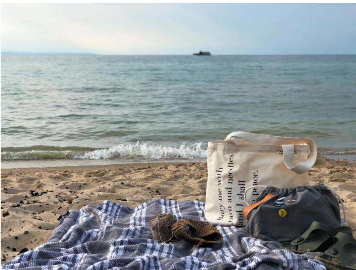
Golden hour at Good Harbor Beach. The Mishe Mokwa , out on its Sunset Cruise, in the background.

It's not over yet! Yes, kids are heading back to school. Yes, there's a bit of a chill in the air at night...and in the morning. But the days are warm and golden for the foreseeable future, and we'll be honest: September is one of our very favorite months to be here. The shops are open, the restaurants are serving up seasonal harvest favorites, the Big Water is warm and the sunsets are magical.