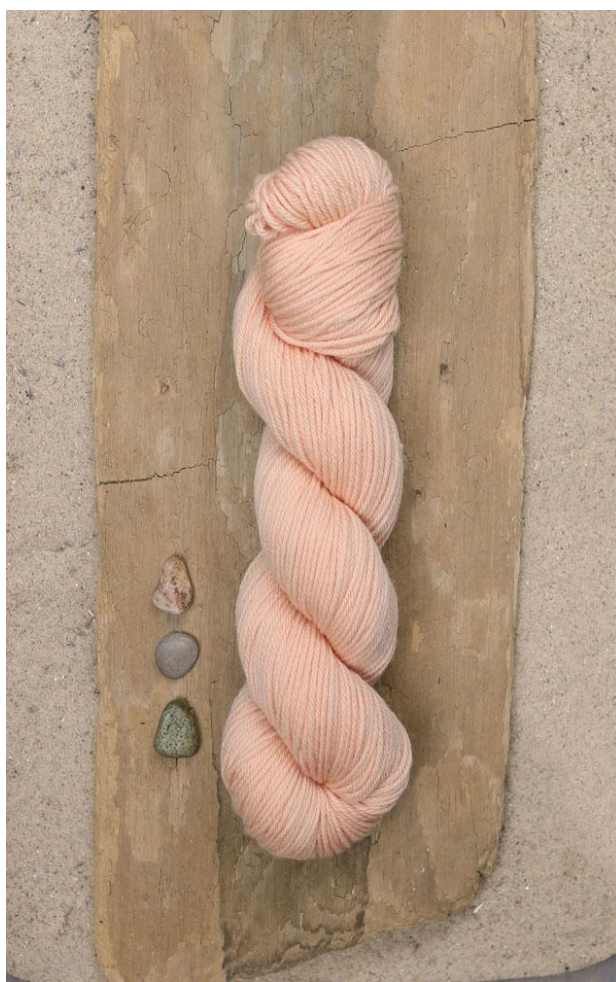
Jagerspun Super Lamb in Apricot--100% grown, spun + dyed in the USA

This week we've added some of our favorites to the yarn section: Madelinetosh DK , Jagerspun Super Lamb and all of our Hedgehog Sock . The brand-new YOTH Yarns Daughter is online, as well as Brooklyn Tweed Arbor , and a new batch of the Lykke Driftwood Interchangeable needle sets .