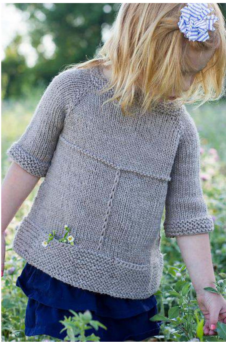
Puddle Duck Sweater Kit