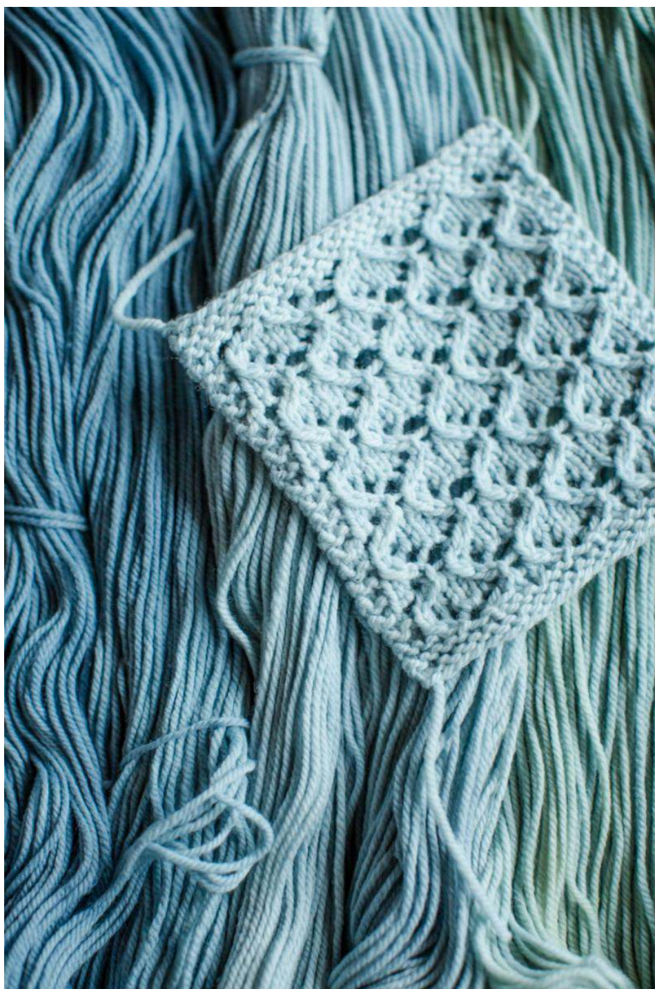
220 yards | 100 grams | worsted weight Climate Beneficial Wool, sourced from Surprise Valley California Spun in Maine, naturally dyed in Pennsylvania