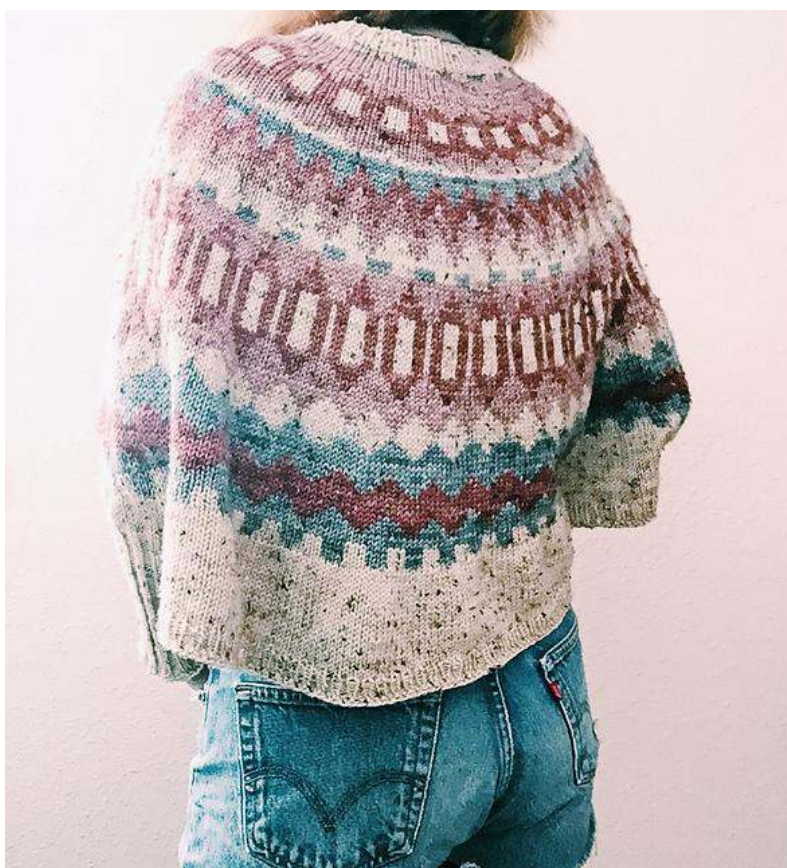
Ninilchik Swoncho Kit