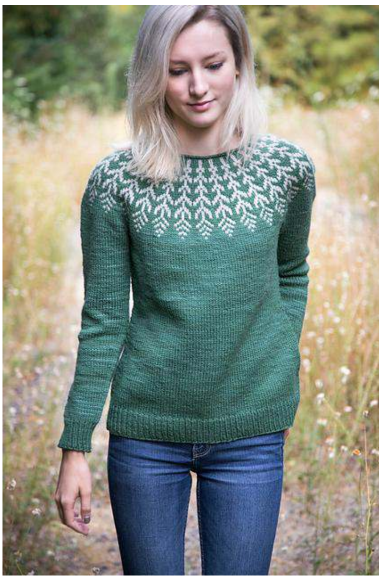
Fern + Feather Sweater Kit