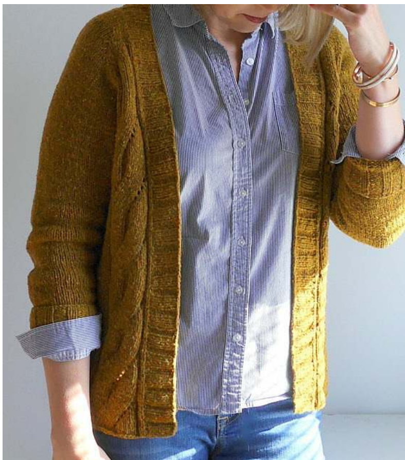
Stillwater Sweater Kit (also known as the 4-day sweater!)