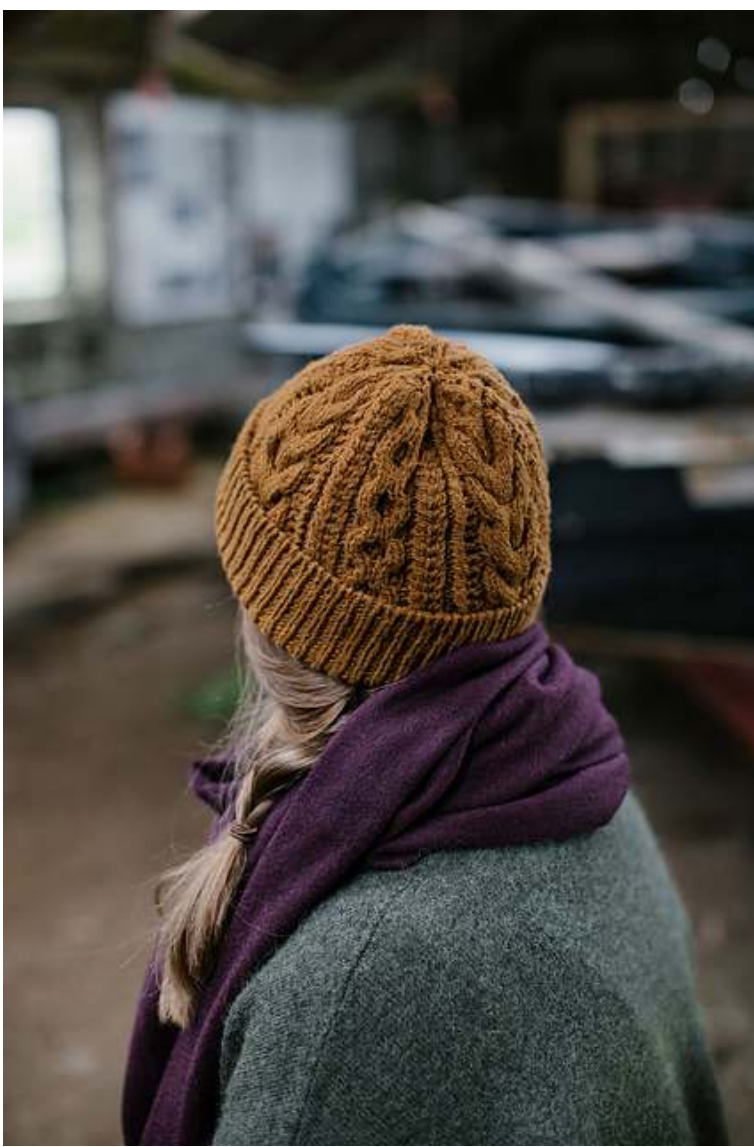
Brackett Hat Kit