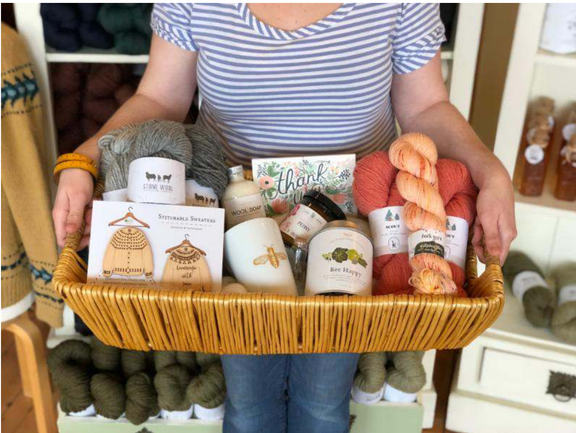
(an amazing gift basket--valued at over $250!)

-a brand new, custom wood-burned needle gauge for everyone who walks in the door (will also be included in ALL online orders placed on 4/21)